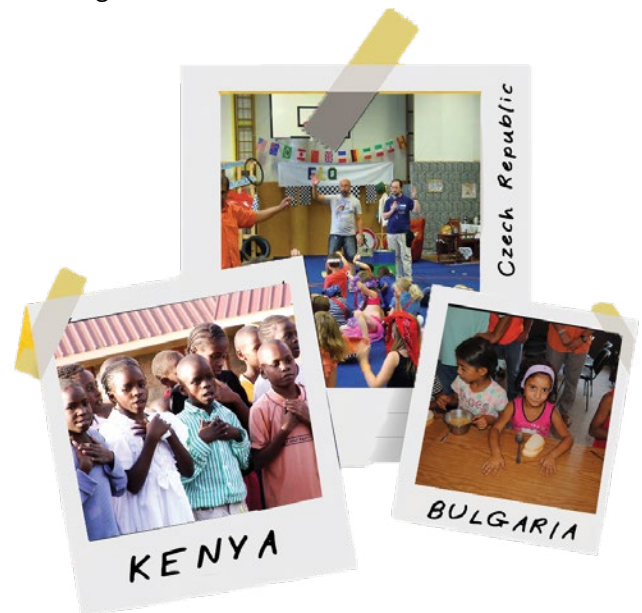
Three of the seven This Little Light of Mine projects

This Little Light of Mine focuses on aiding already existing projects geared toward children. We offer a free curriculum to help you teach your kids about missions. We're all about kids helping kids! More information is found at tllom.org .