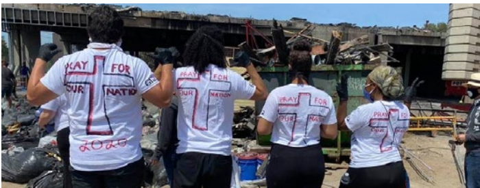
Youth and members of the Monte Sinai Church in Minneapolis pray over burned buildings in their city.

While the East Flatbush church could have listened to all the stories about the declining economy, they moved forward with the vision that God had given them and remained a church on mission.