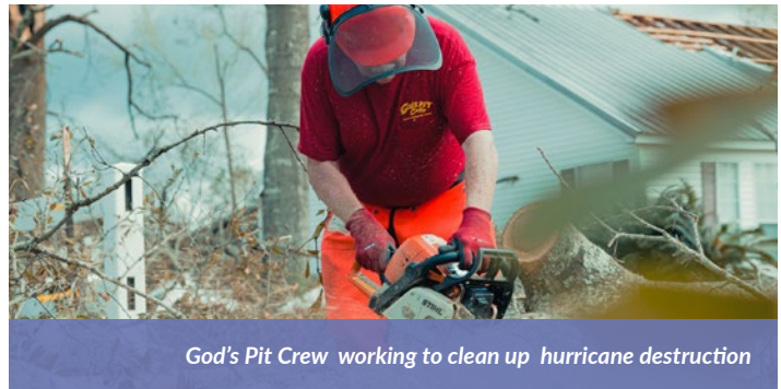
God's Pit Crew working to clean up hurricane destruction

When a hurricane hits, Church of God disaster relief efforts are often in place and operational well before governmental services arrive. Providing food and water, a hot meal, or a team of construction workers to clear roads or